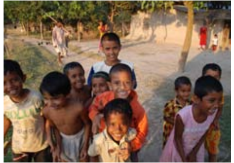
Children smiling for an IVUmed resident scholar in Bangladesh

These resources will help IVUmed partners and members stay current on the latest surgical techniques. Participants will be able to view surgical videos and presentations, add comments and post questions, and even add additional video or slides to detail suggestions and alternatives. With increasing worldwide demand for IVUmed's services among sites with growing patient populations, these online resources will enable IVUmed to reach more sites and to provide continuous training to physicians eager for information.