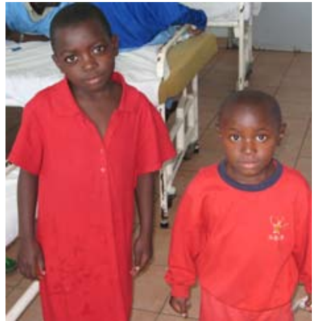
Children in the hospital in Tanzania