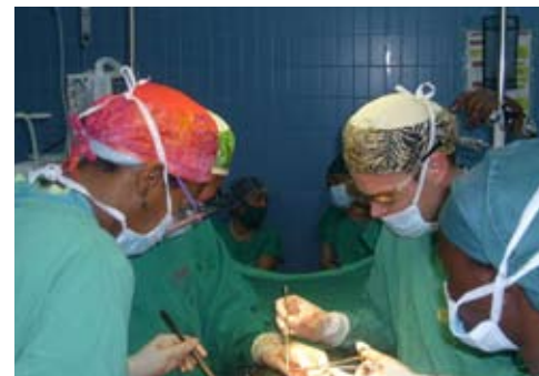
Volunteers conducting hands-on surgical training in Maputo, Mozambique