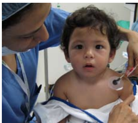
One of the 87 pediatric patients seen during a training workshop in San Pedro Sula, Honduras